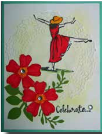
One of Virginia Orenos's marvelous cards