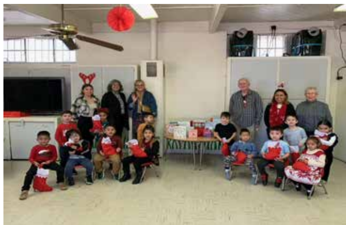
Preschoolers with their Stockings