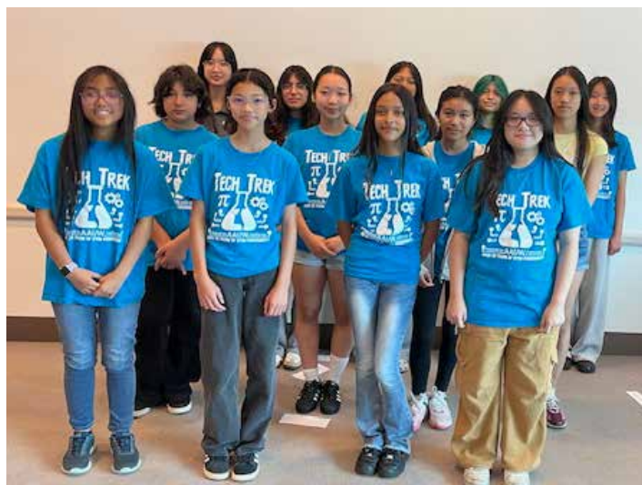
Alhambra-San Gabriel TechTrek Campers: